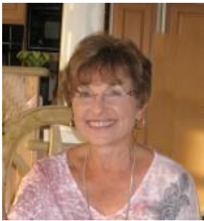
Joyce Katz Lifetime Service Award