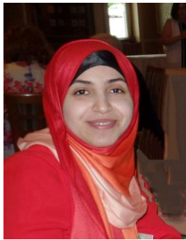
Shima Rostami Community Service Award