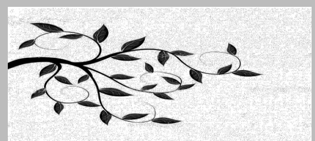
AAUW Advances Gender Equity for Women and Girls Through Research, Education and Advocacy.