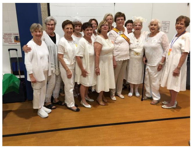
Modern Day Suffragettes