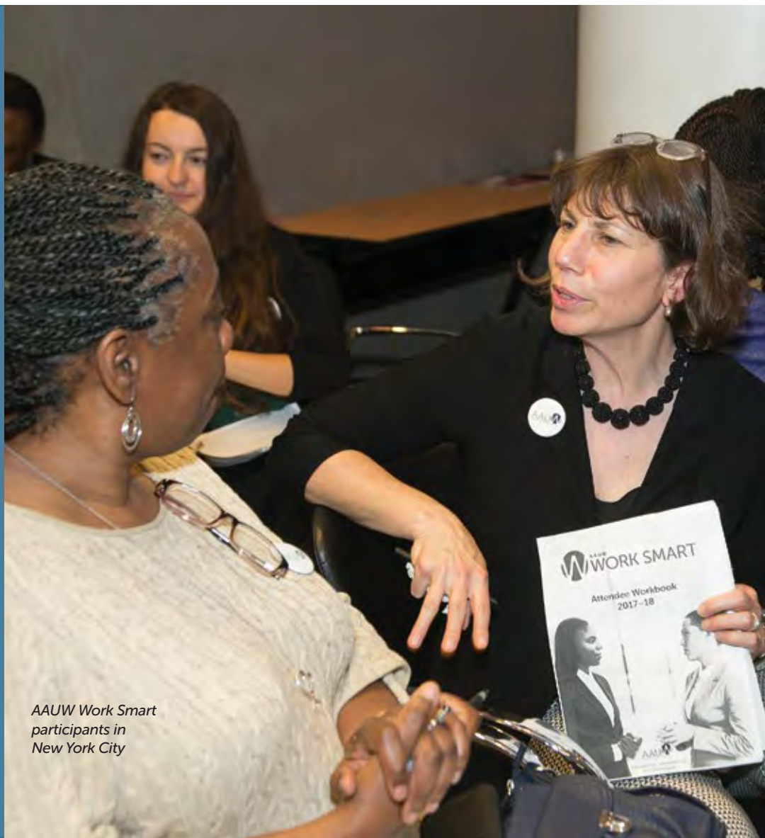
AAUW Work Smart participants in New York City