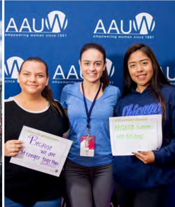
AAUW student leadership conference attendees