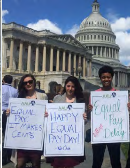
AAUW equal pay advocates on Capitol Hill