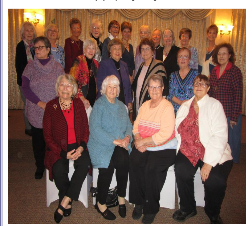
B-C Members Enjoy Spring Fling Luncheon Event