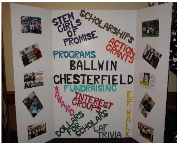
Ballwin-Chesterfield Display Board highlights Branch programs and events.