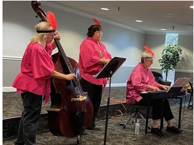
The Queens of Swing performed many enjoyable classic jazz songs.