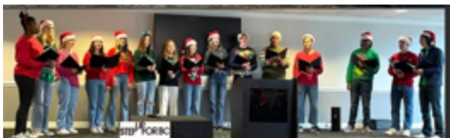
Entertainers: The Parkway West High School Jazz Choir