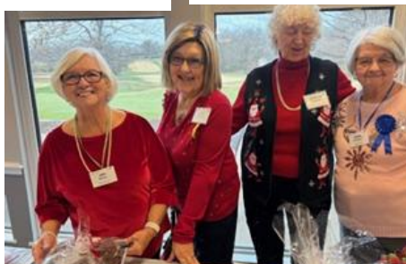
ELEGANT EDIBLES returned Lavish bids were made on gourmet creations, mostly homemade specialties