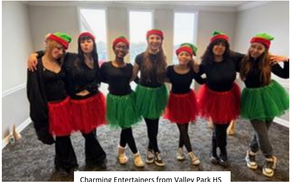
Charming Entertainers from Valley Park HS