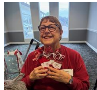
Raffle and drawings, gifts, poinsettias, candy and goodies added to the fun.